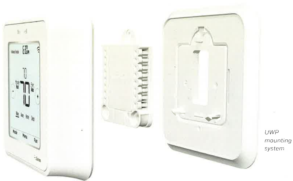
UWP mounting system