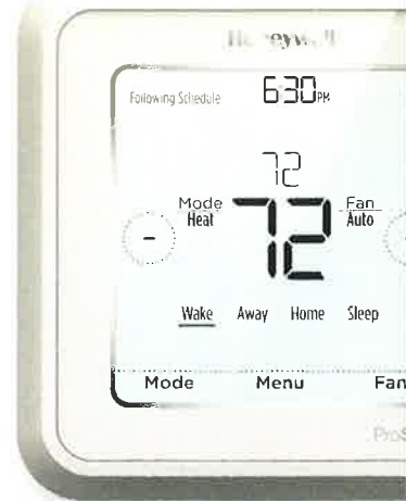
Lyric™ T6 Pro Wi-Fi

The Lyric T6 Pro Wi-Fi seamlessly integrates with Apple® HomeKit™, Amazon Echo® and more for customers who want to control all their smart home devices from a single app. See the ever-growing integration list at forwardthinking.honeywell.com/ecosystemintegrators .